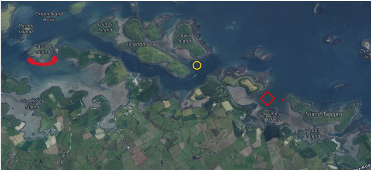
Figure 1: Sites Surveyed underwater as potential Tern Raft Locations - South of Darragh Island; South of Pawle Island ( Preferred first Location yellow circle) and West of Taggart Island.

The Three potential sites have already been surveyed ( Figure 1) using an ROV to check the habitat type beneath the potential moorings and substrate types. As no priority species were found the site is suitable for a traditional single point swinging mooring which can be installed in one trip by Cuan Marine Services. . The Tern raft is built on land and is attached to the mooring in time for the Tern Breeding season ( Second Laying in May). The Tern Raft can also be detached for servicing over the winter months and stored on land which also reduces the likelihood of the mooring needing to hold ( and therefore be strengthened or need additional chain) in the significant winter storms.