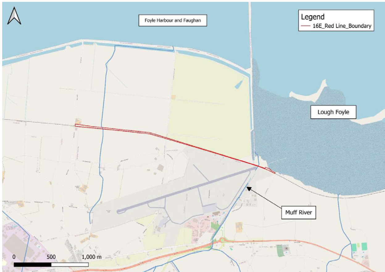
Figure 2-2: Surface water hydrology