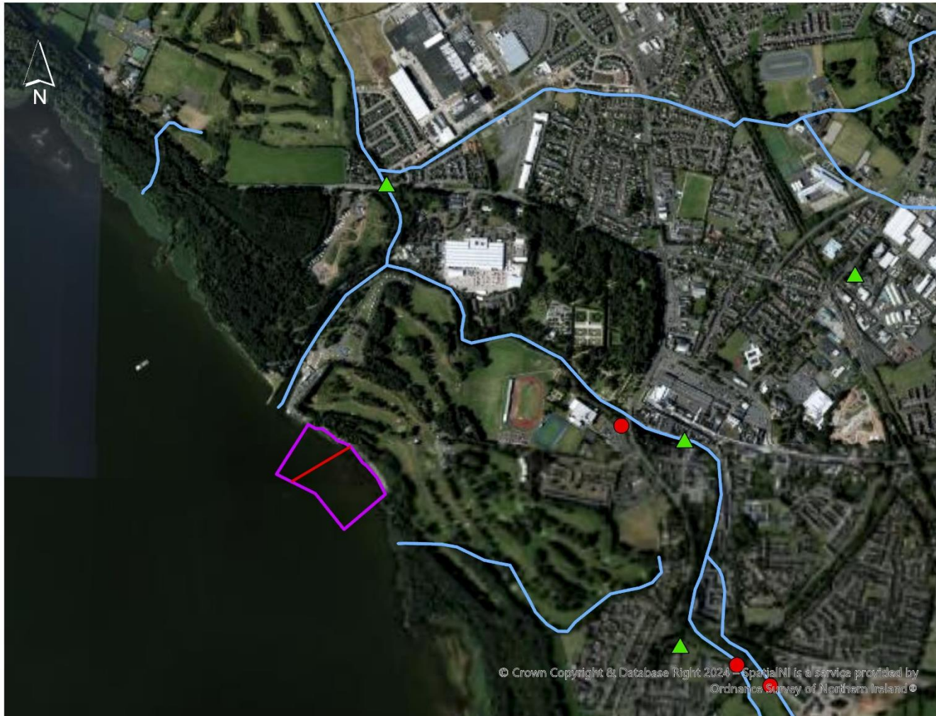
Map 1 Rea's Wood Bathing Water