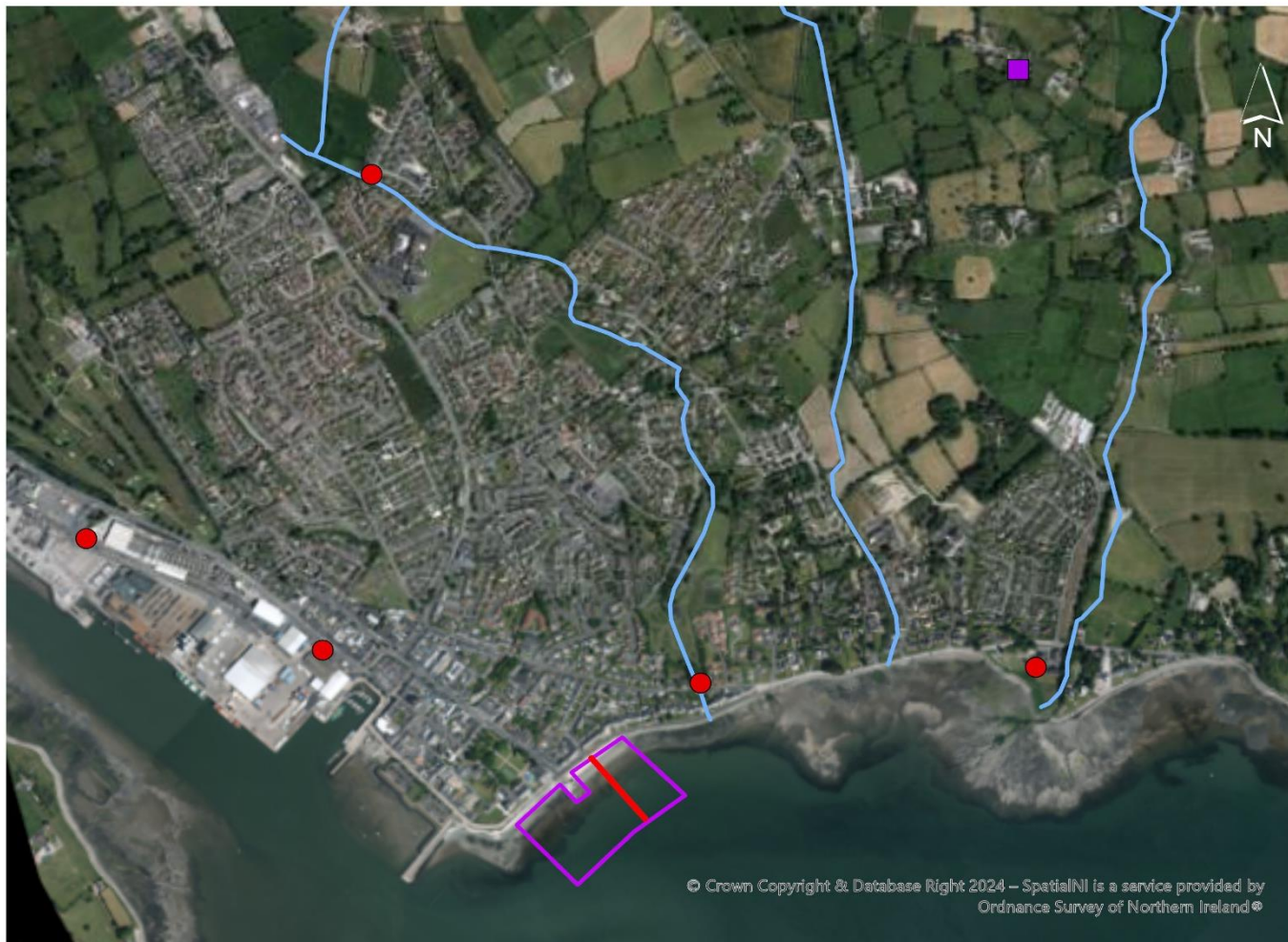
Map 1 Warrenpoint Bathing Water