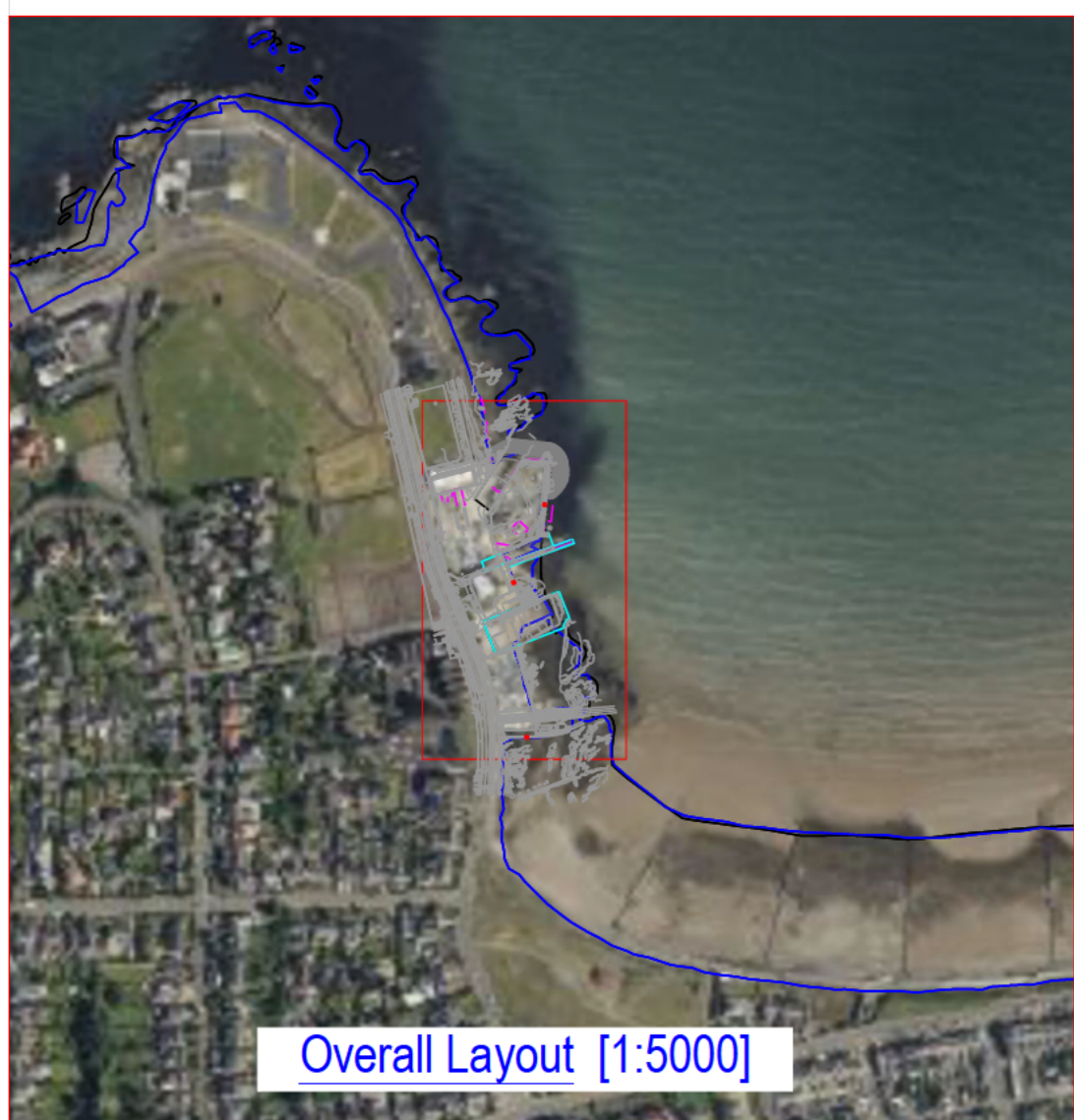
Overall Layout [1:5000]