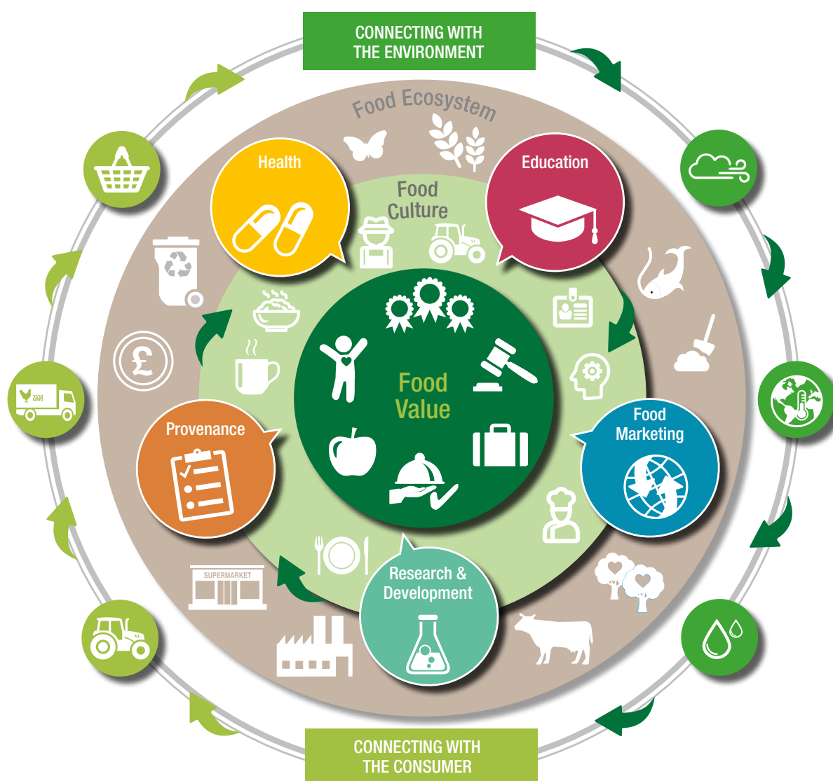
Figure 1: Relationship between how we produce and consume food and how we care for our health and our environment.

The rationale for government involvement in food is clear. Food is at the heart of a healthy society. The social, health, environmental and economic components of our food system are interdependent. The relationship between how we produce and consume food and how we care for our health and our environment is complex (Figure 1).