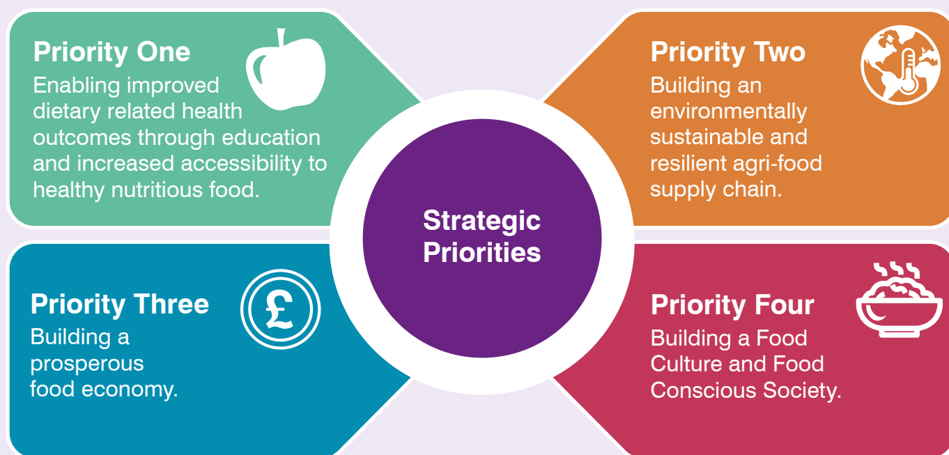
Figure 3: Food Strategy Framework Strategic Priorities.

There is no hierarchy, all four strategic priorities are equally important, they are interlinked rather than standalone and support a holistic, synergistic, systems approach to addressing major food related societal issues.