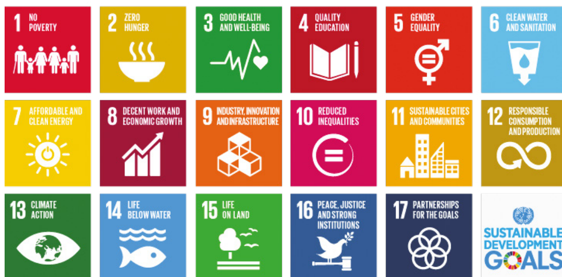
Figure 4: UN Sustainable Development Goals.