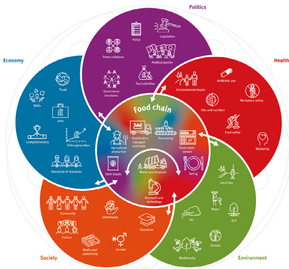
Figure 2: The Food System.

A Food Systems approach embraces all the elements and activities that are involved in feeding a population: the production, processing, distribution, supply, marketing, consumption of food and drink and handling of waste; and the consumer values and behaviours that influence these processes (see Figure 2).