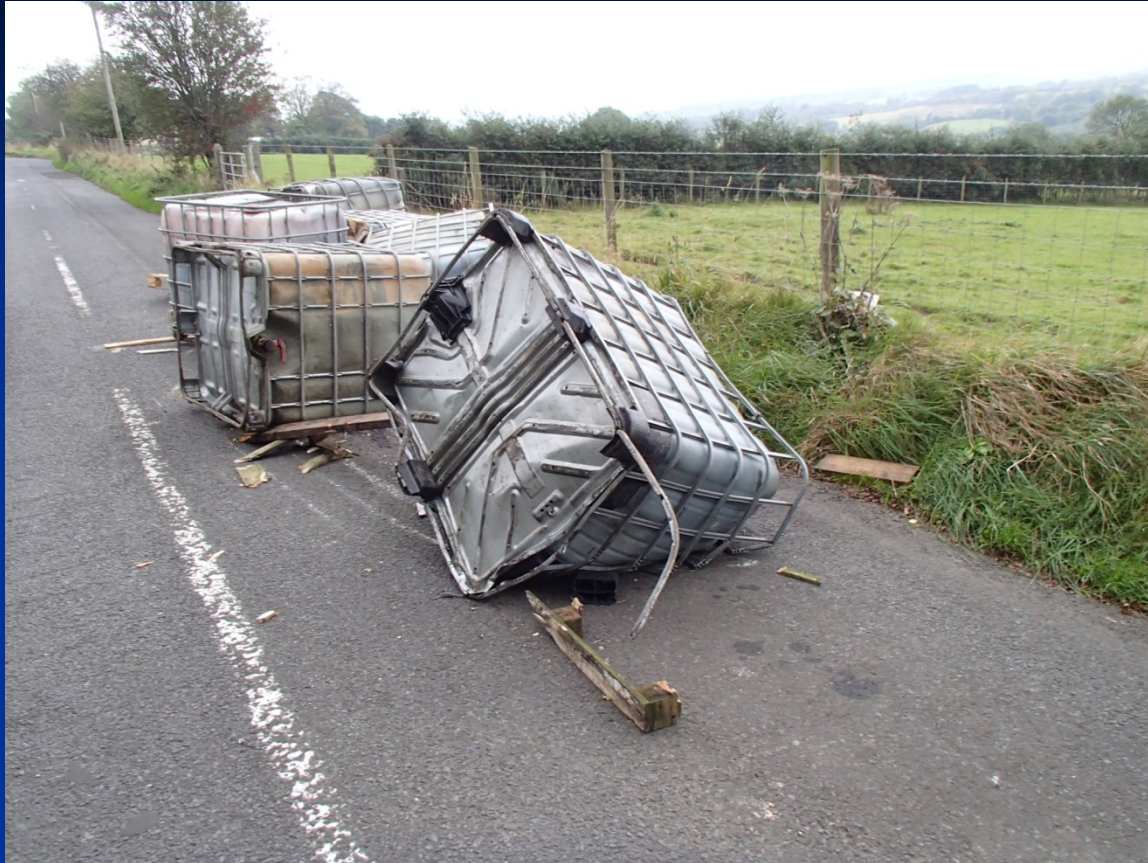
Laundered Fuel Oil Waste